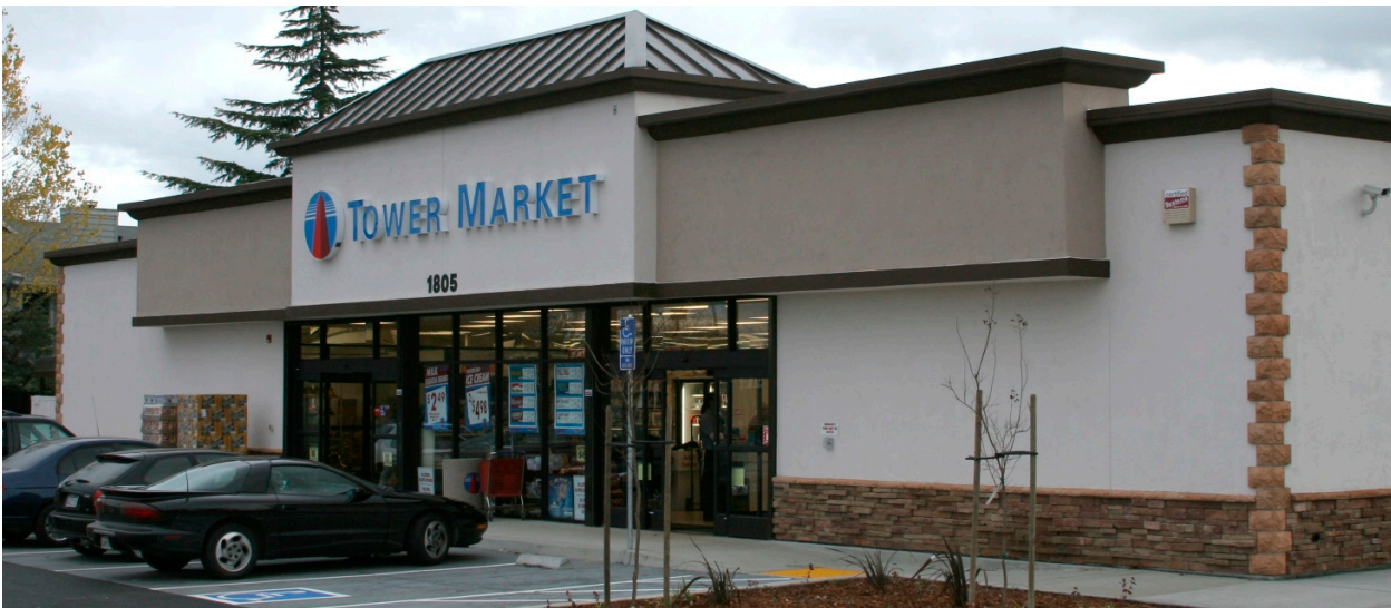
1805 Willow Pass Rd