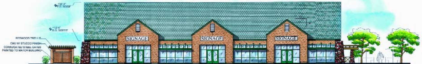
EAST ELEVATION OF WEST BUILDING SCALE: 1/8" = 1'-0"

ARC Inc. was hired by the Master Developer of the of Hiddenbrooke in Vallejo to provide a design services for a small retail center to serve this new upscale golf community. The 11,000 SF of buildings were designed to tie into the existing Golf Clubhouse with flexibility to accommodate tenants from 500 to 3500 square feet.