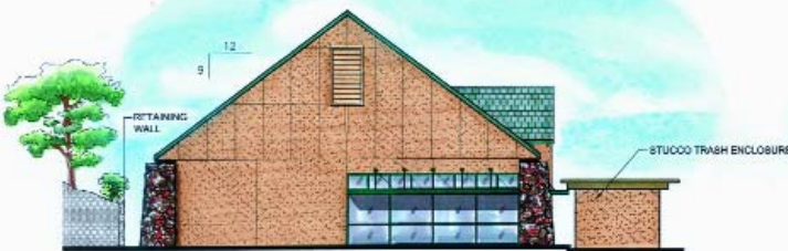
SOUTH ELEVATION OF WEST BUILDING SCALE: 1/8" = 1'-0"