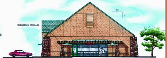
NORTH ELEVATION OF WEST BUILDING SCALE: 1/8" = 1'-0"